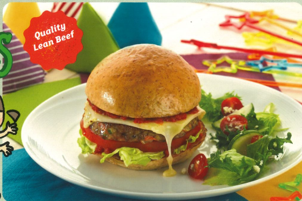
Beef Burger 牛肉汉堡